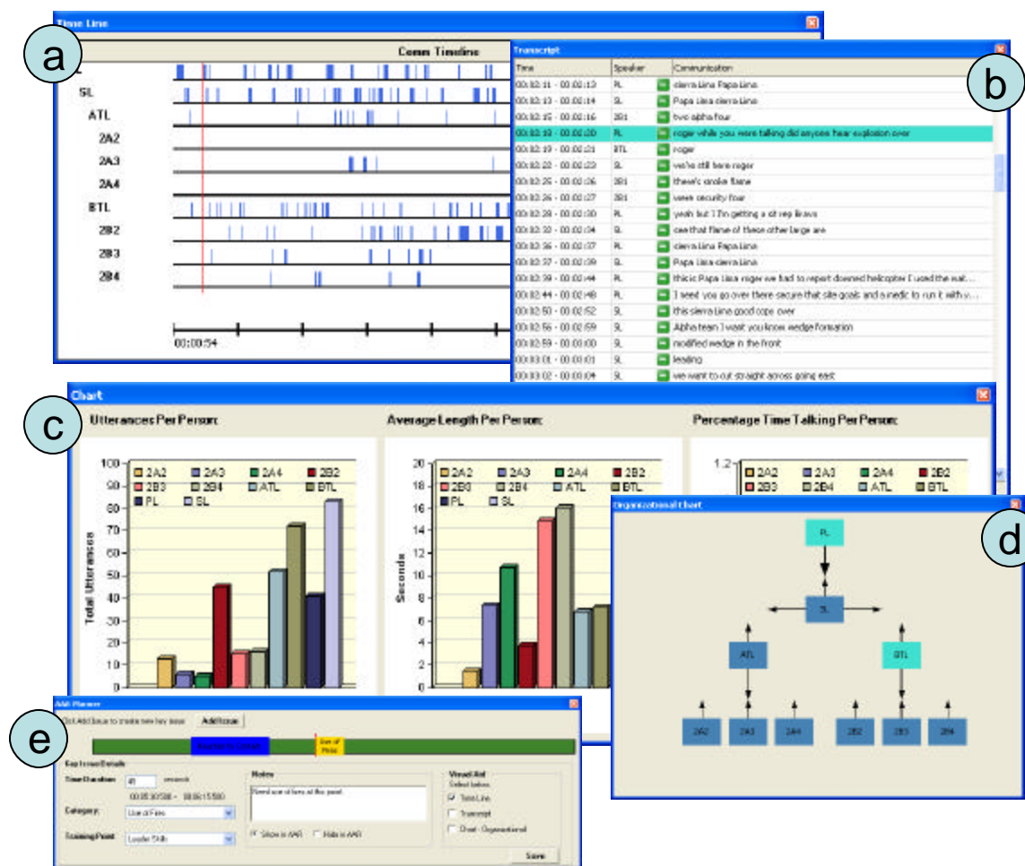
Figure 3. AutoCAS Communications Analysis Interfaces

STAT system is operated by a single observer/controller sitting at the Logger